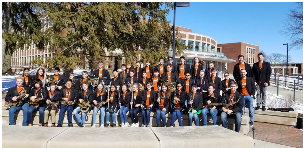
ZMS Jazz Band

ZEF Imagine Professional Development Grants give ZCS educators funding for growth and renewal opportunities. Every profession benefits from the chance to expand knowledge and learn new things. When teachers have the chance to do this, it also benefits our schools and students for years to come. ZEF Imagine Grant recipients bring these experiences and perspectives back to the classroom and back to their students.